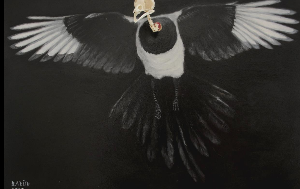
Intersection no:3, 2017

Charcoal, acrylic, plexiglass on board 35x50 cm