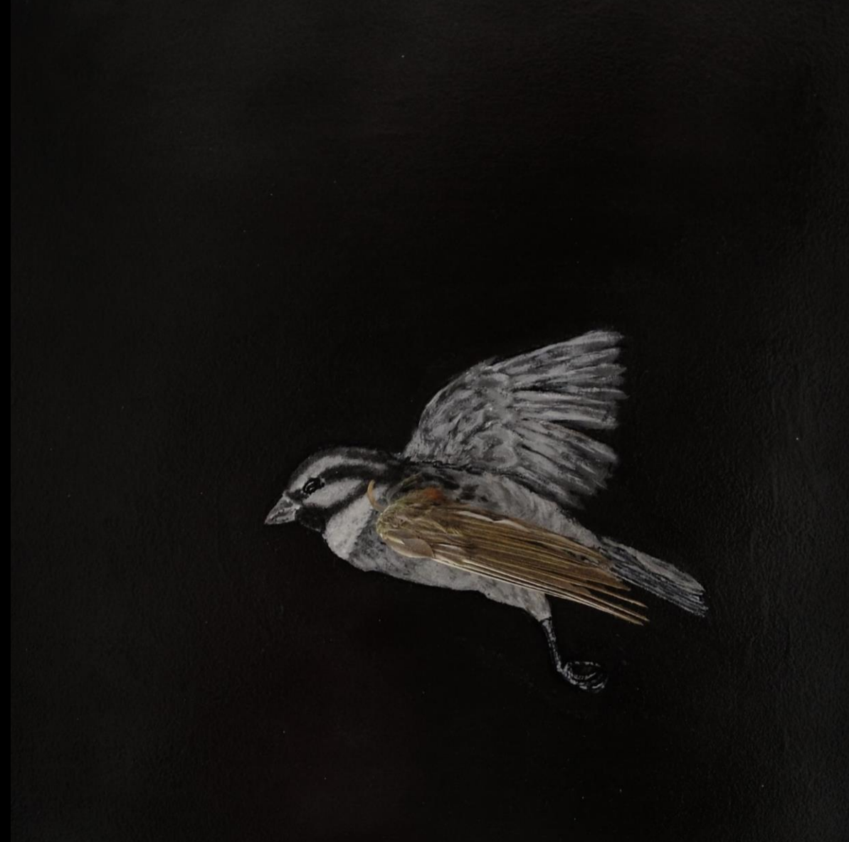
Intersection no:2, 2017

Charcoal, acrylic, embalmed bird wing on board 25x35 cm