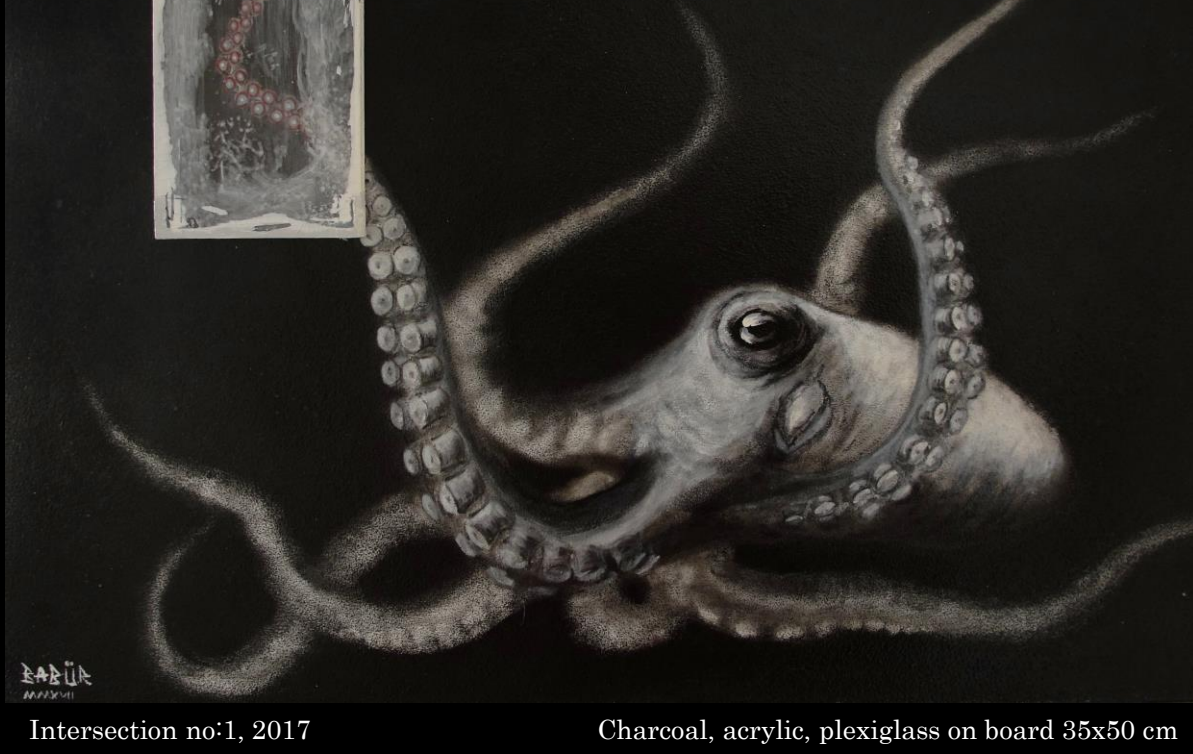
Intersection no:1, 2017

BSc, Biology (2015) Middle East Technical University,